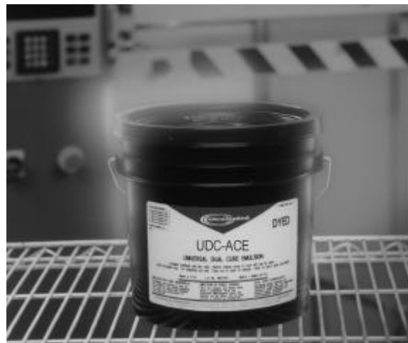
UDC-ACE emulsion is for use with water, solvent, co-solvent, UV and plastisol based inks. Available in dyed formulation only.