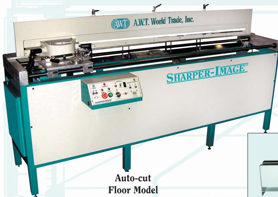
Auto-cut Floor Model