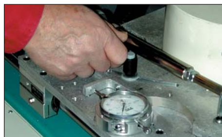
Features include variable speed and adjustable chamber control.

Need high-quality squeegee blades, fabric and frames? Be sure to ask for a copy of our Supply Catalog!