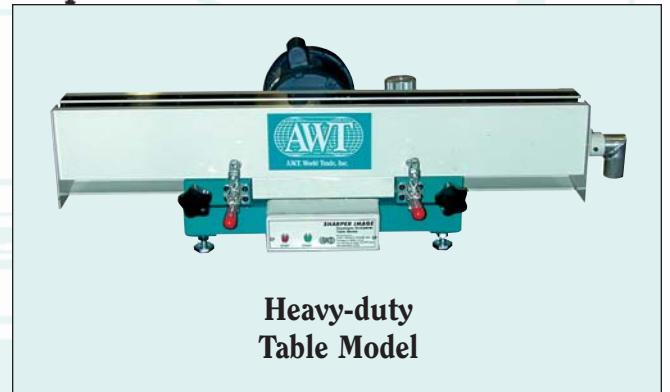
Heavy-duty Table Model