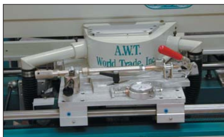
The Sharper-Image Auto-Cut models come standard with a wheel cooling and cleaning system.

* Electrical conversion to 220 V, 1 PH, 50 Hz is available - see Options & Accessories above