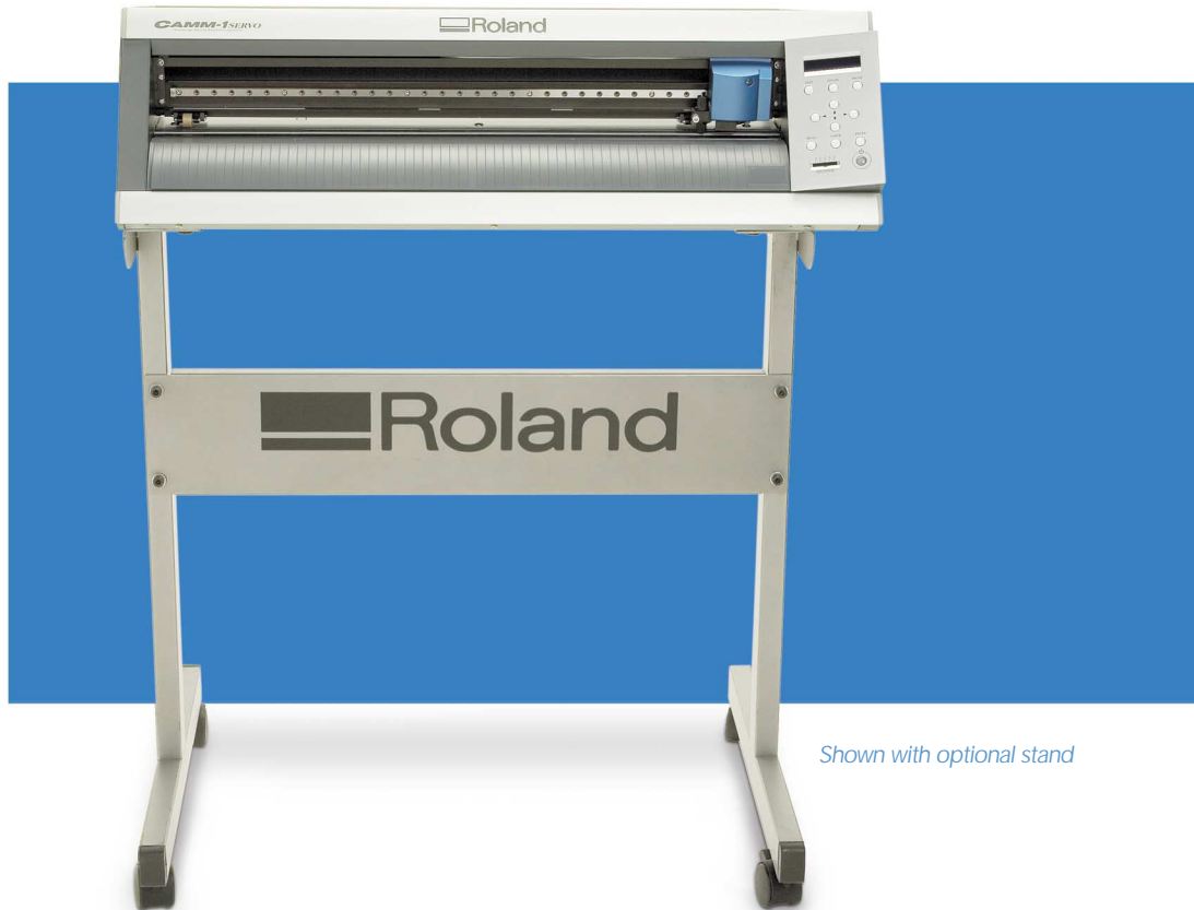
Shown with optional stand

Digital servomotor technology ensures the cutter's maximum accuracy and cutting speeds up to 20-inches per second. Easy access USB and serial ports make connectivity a snap.